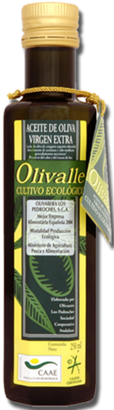
Imagen del tipo: