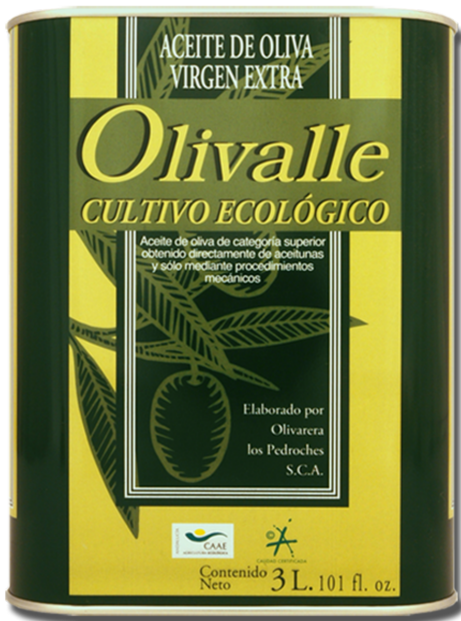
Imagen del tipo: